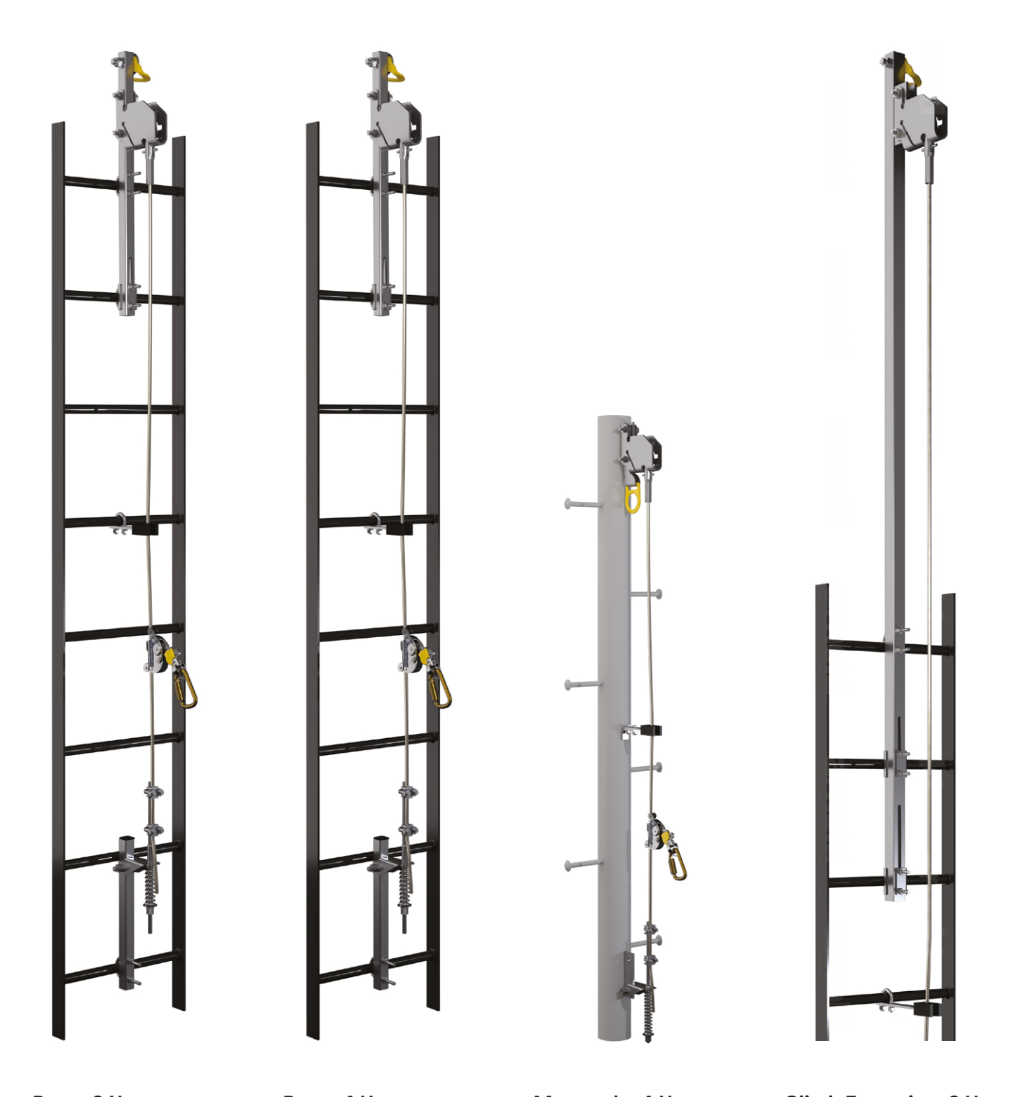
Rung, 2 User Stainless Steel - <u>6116632</u> Rung, 2 User Galvanized Steel - <u>6116631</u>